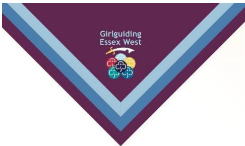
County Necker - £8.50

Each of the above two items can be personalised at an additional cost of £3.00 per item (Right Breast – Max 2 Lines)