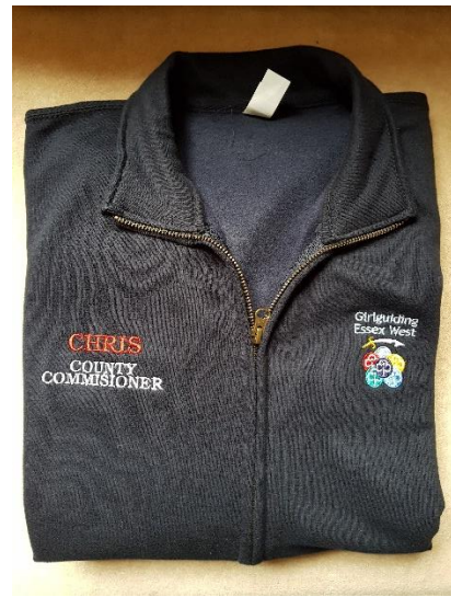
County Full-Zip Sweatshirts - £25.00

Each of the above two items can be personalised at an additional cost of £3.00 per item (Right Breast – Max 2 Lines)