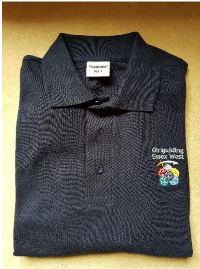
County Polo shirt - £15.00

The following items can be purchased from the County Office – please make cheques payable to Guide Association Essex West